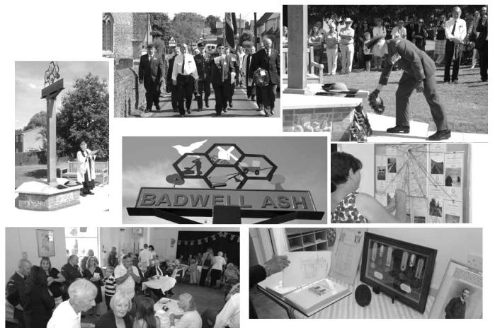
Commemoration Day